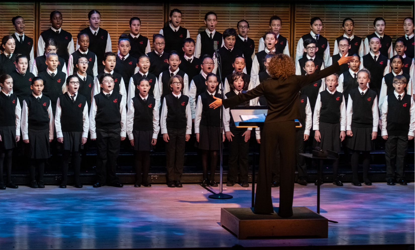
Carnegie Hall, New York