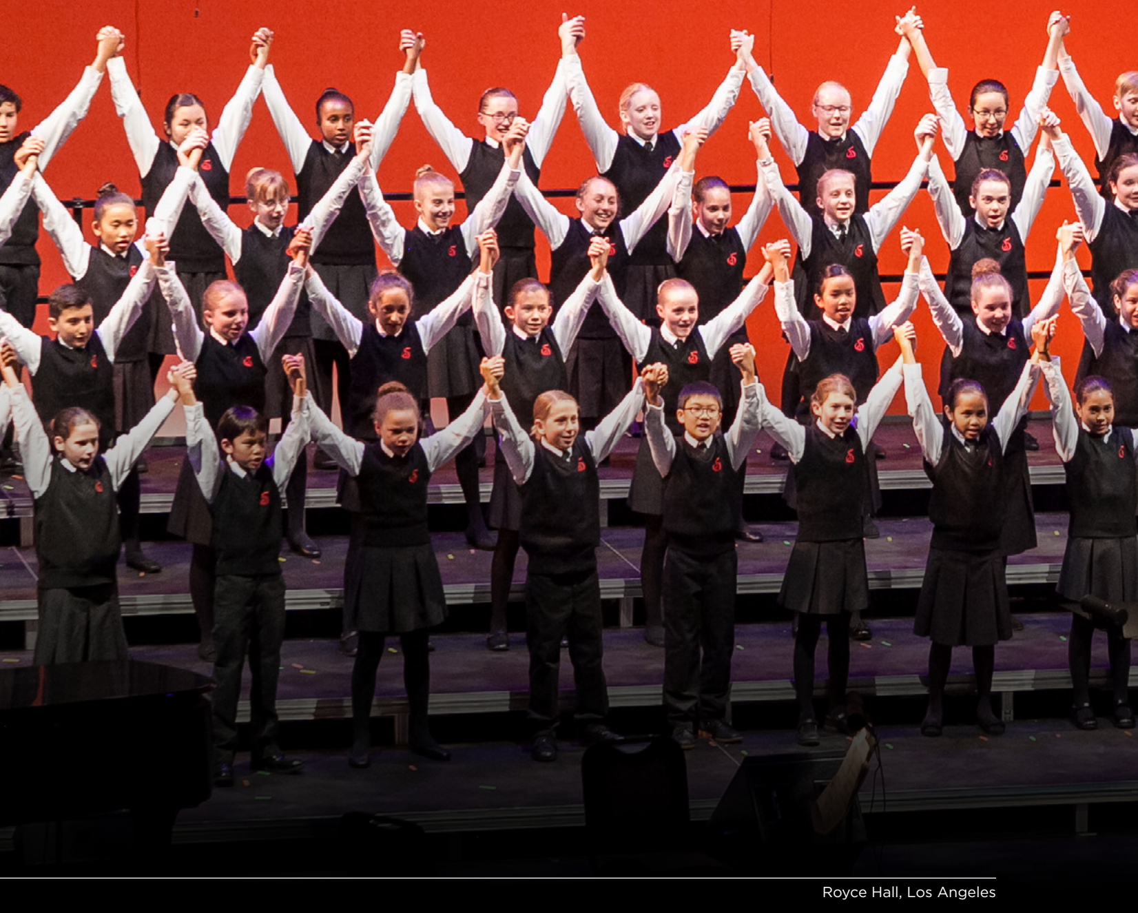
Royce Hall, Los Angeles