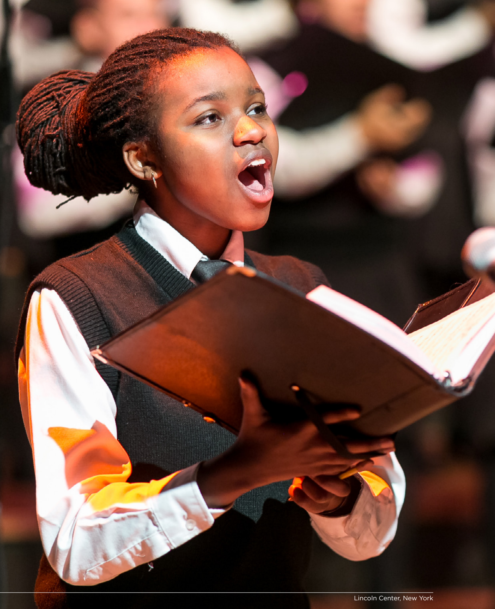
Lincoln Center, New York